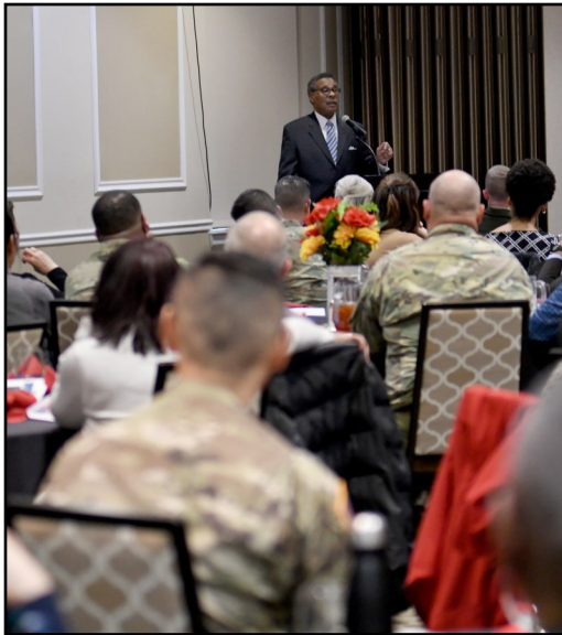
Rep. Emanuel Cleaver, II of Missouri, speaks about the impact black Americans have made on American history during the Fort Leavenworth Black History Month observance Feb. 21, 2023 at the Frontier Conference Center, Fort Leavenworth, Kan.