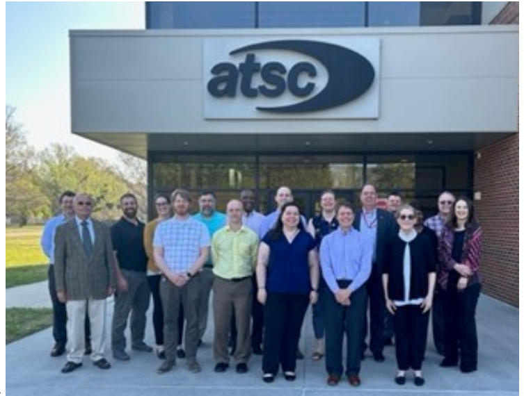
The Army Training and Support Center (ATSC) hosted the US Army Research Institute (ARI) professional development off-site meeting for its GS-14 level researchers at the Army Training Support Center at Fort Eustis, VA on 4 and 5 April 2023. These researchers are the primary leaders of research programs across ARI.

Throughout the meeting several CAC-T personnel observed and participated in the ARI discussions on the ongoing research programs as well. The meeting provided opportunities for the CAC-T/TSAID Science and Technology Office to lead discussions on the vision of the ATC 2030 with a critical group of research leaders at ARI. The ATC 2030 focuses primarily on collective training and